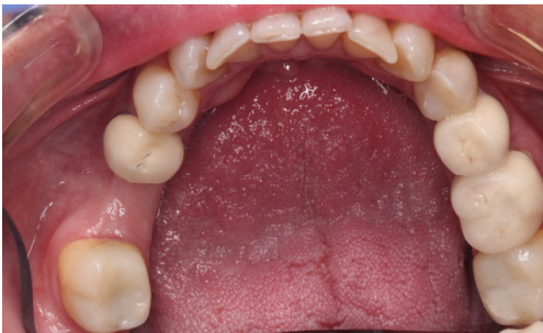
Before dental implant