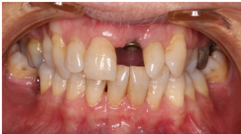
Before dental implant