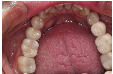
After dental implant